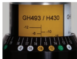
GH493 / H430