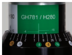
GH781 / H280