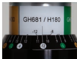
GH681 / H180

This machine is designed to easily adjust to the Aeroquip™ and Weatherhead™ core products. It's as simple as turning the collar to the correct color to match the layline on the hose, adjust the ring so that the correct size dot aligns with the correct size line on the collar and the machine is set for the correct crimp. Load the correct crimp die based on the crimp die chart attached to the machine, and the machine is ready to crimp.