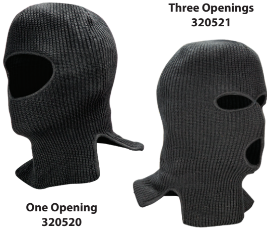
One Opening 320520