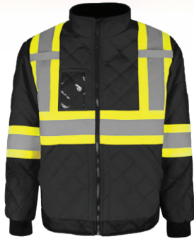
BLACK QUILTED FREEZER JACKET

The Canadian Standards Association's High Visibility Safety Standard - CSA Z96-15 - covers two garment design elements. The layout of reflective striping and luminance of background fabric determine three Classes of safety.