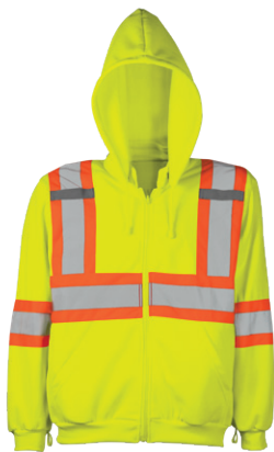
LIME GREEN TRAFFIC HOODIE