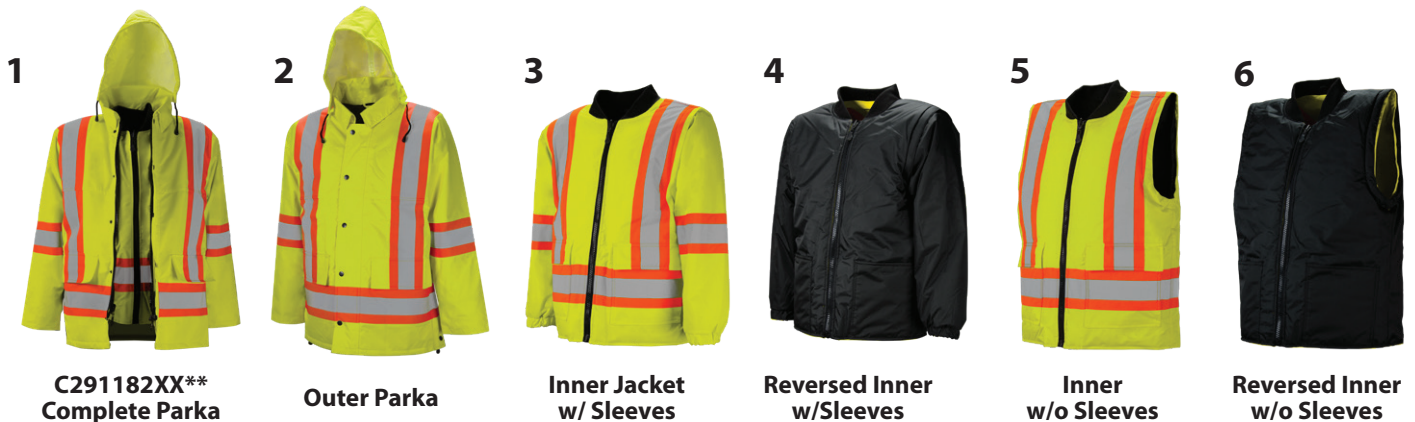
C291182XX** Complete Parka