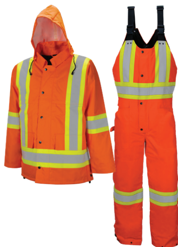
ORANGE WINTER TRAFFIC PARKA PAIRED WITH ORANGE WINTER TRAFFIC OVERALLS