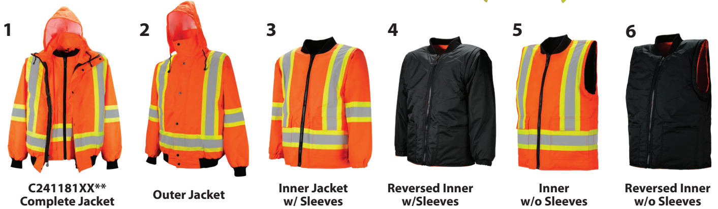
C241181XX** Complete Jacket